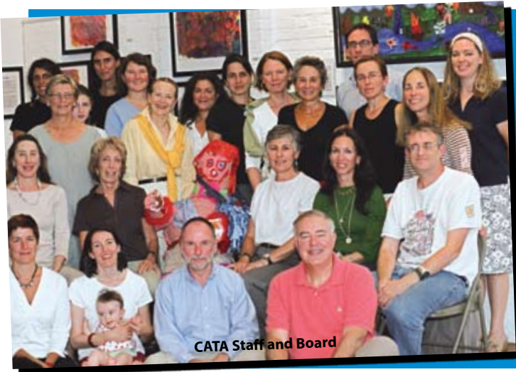
CATA Staff and Board