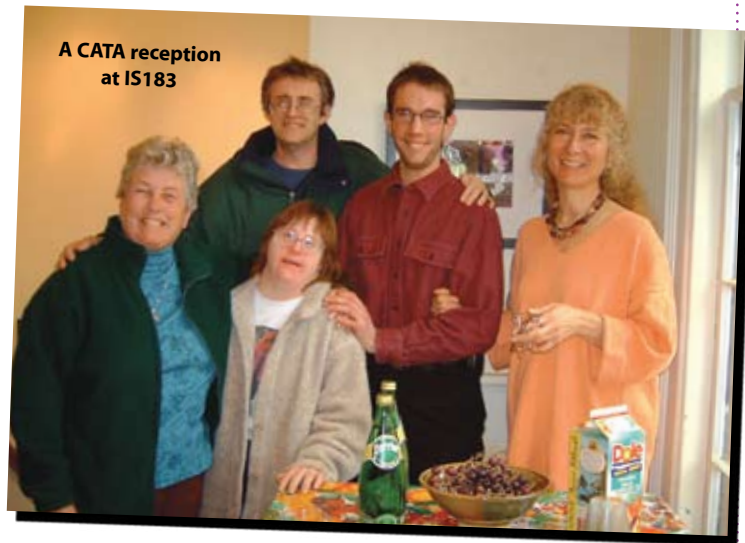
A CATA reception at IS183

This summer program partners CATA participants with community volunteers to enjoy performances at many Berkshire County cultural venues including Berkshire Theatre Festival, Barrington Stage Company, and Shakespeare & Company. CATA cultural partners donate all tickets.