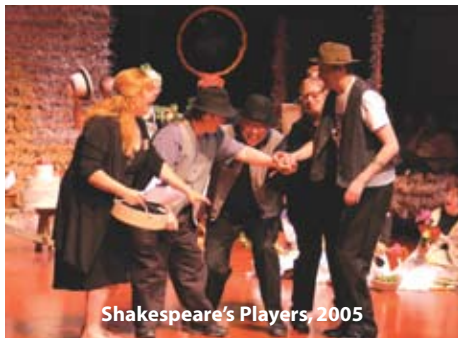
Shakespeare's Players, 2005

Based on an educational model developed for school residencies by Shakespeare & Company, this energetic group of eighteen has produced short adaptations of Macbeth , A Midsummer Night's Dream , Romeo and Juliet , and The Tempest . The prompting of lines to all actors transforms the stage to a place where the audience and the actors focus on acting rather than disability. In fact, the cast includes actors who are not verbal, yet embellish scenes and enchant audiences with their presence onstage.