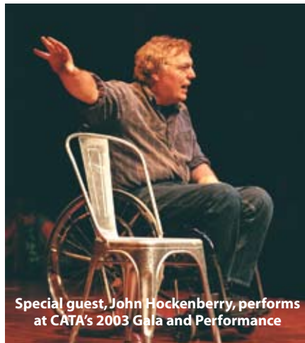
Special guest, John Hockenberry, performs at CATA's 2003 Gala and Performance