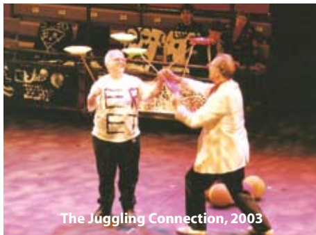
The Juggling Connection, 2003