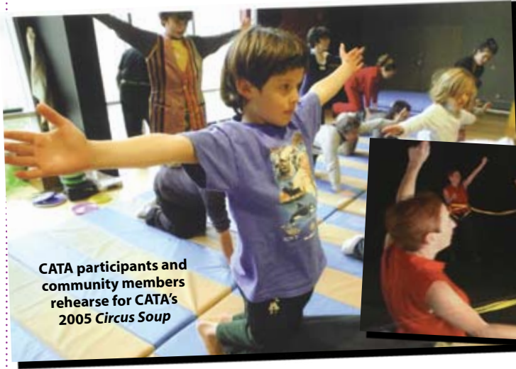
CATA participants and community members rehearse for CATA's 2005 Circus Soup