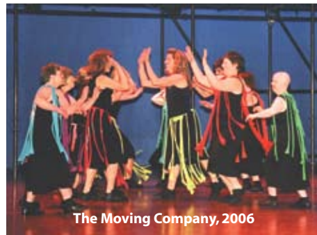
The Moving Company, 2006