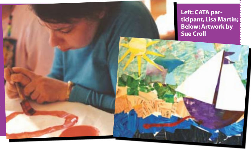
Left: CATA participant, Lisa Martin; Below: Artwork by Sue Croll

In this core program, CATA participants attend workshops led by CATA faculty artists skilled in the visual and performing arts. Visual arts workshops include drawing, painting, collage, sculpture, woodworking, and set and costume design. Performing arts workshops include singing, drumming, dancing, juggling, and acting. Other workshops include poetry and yoga. Read more about our five performing arts companies.