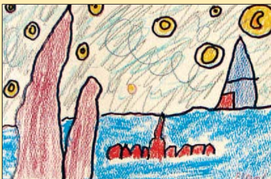
By Ellen Gerlich