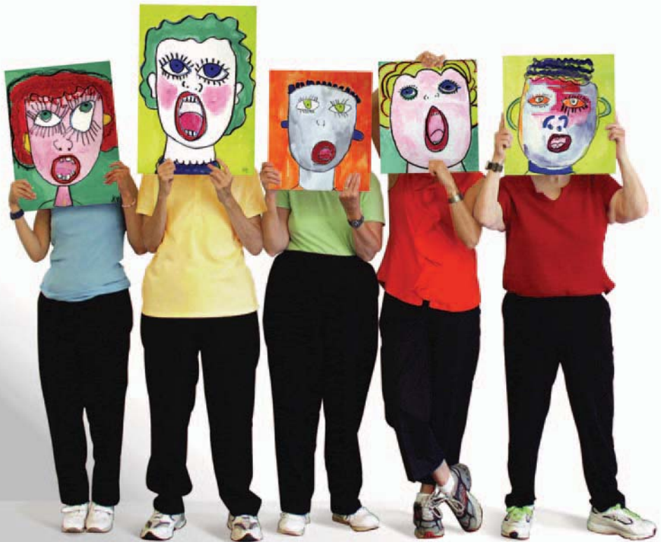
"I Am A Part of Art" invitation; Left: Event Photos.